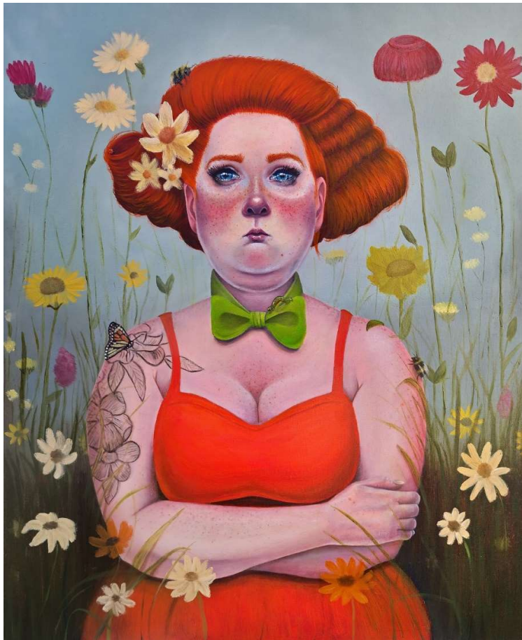
Highly commended: Lady Of The Flowers by Leah Davis from the Society of Caithness Artists